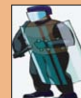
Riot / Civil Commotion