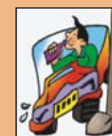
Damage from a Vehicle