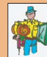
Emergency Repair After Loss

Affordable Insurance — Unsurpassed Service