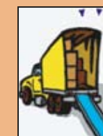
Emergency Removal of Personal Property